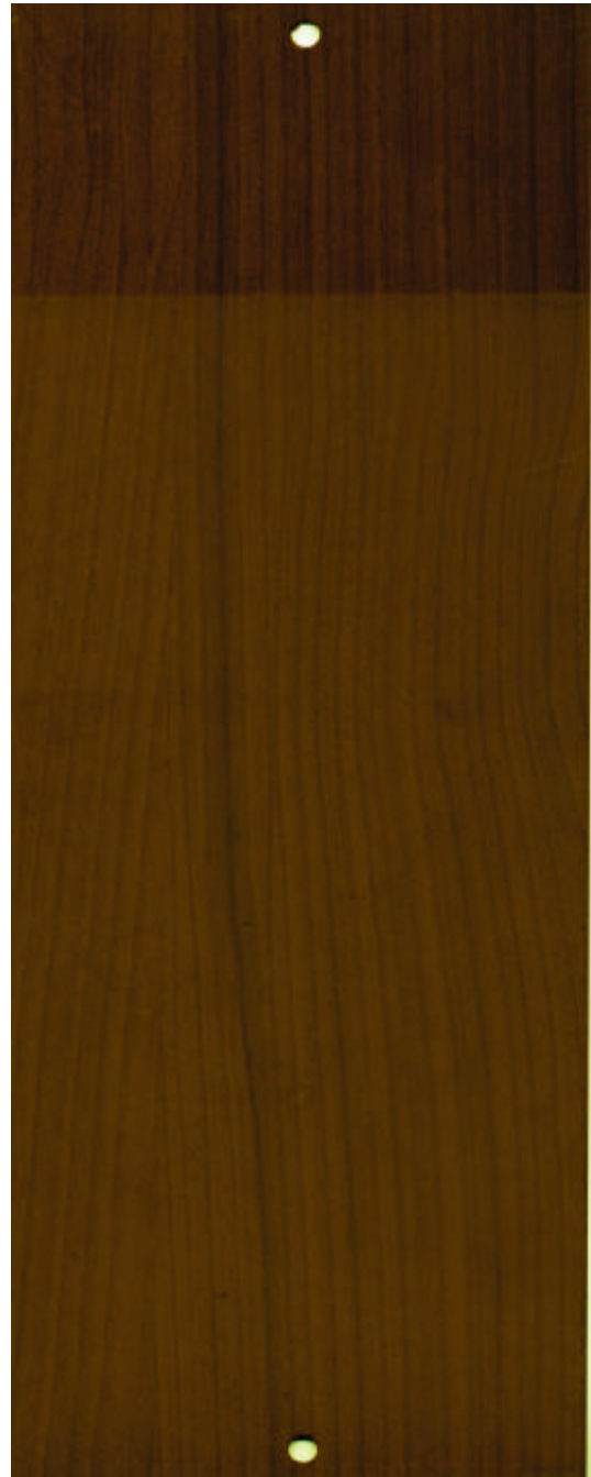
Sample nr. 207

Base: NON PROTEK POWDER Decoration: PROTEK FILM 9061/401 Exposure beginning: 10/04/01 End of exposure: 10/04/02 Thickness: 67 microns